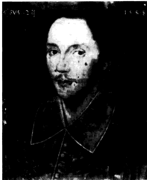
Fig. 2 The 'Droeshout' Portrait (First Folio) and the 'Grafton' Portrait (John Rylands Library, Univ. of Manchester)