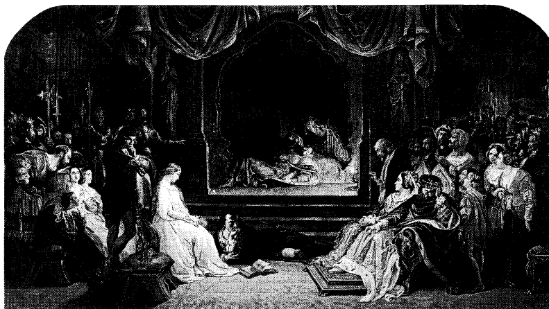
Fig. 7 C. W. Sharpe, after Daniel Maclise, The Play Scene in Hamlet (private collection)