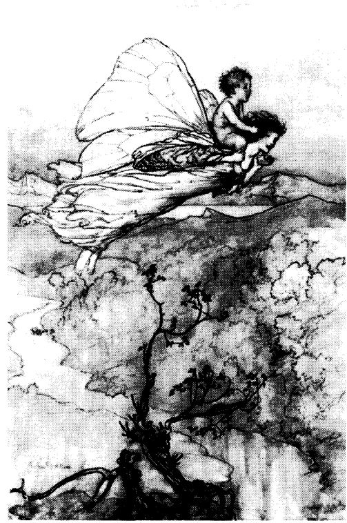
Fig. 8 Arthur Rackham, . . . and her fairy sent To bear him to my bower in fairy land from A Midsummer-Night's Dream (Heinemann)

Arthur Rackham's "Midsummer-Night's Dream" : Arthur Rackham (1867–1939) was born in London and became a clerk at the age of 18. He spent his spare time studying at the Lambeth School of Art, and in 1892 gave up his job to become a full-time illustrator. By 1900, when he brought out Fairy Tales of the Brothers Grimm , he was beginning to develop his entirely original style of fantasy art, combining the quaint and grotesque with the whimsical, but with sufficient artistic rigour and intellectual content to avoid mere cuteness. Often imitated, he has never been equalled, still less excelled. Rackham's version of A Midsummer-Night's Dream (1908) was published by William Heinemann and has been frequently reprinted. It contains forty full-page colour and innumerable black-and-white illustrations. Many of these are fairy paintings, while others are straight illustrations of characters and scenes in the play, but always with Rackham's balance between the charming, the grotesque, and the beautiful. Such is the detail in these pictures that it is hard to find one suitable for a small reproduction: Fig. 8 . . . . and her fairy sent / To bear him to my bower in fairy land is a fair example of the atmosphere and impeccable