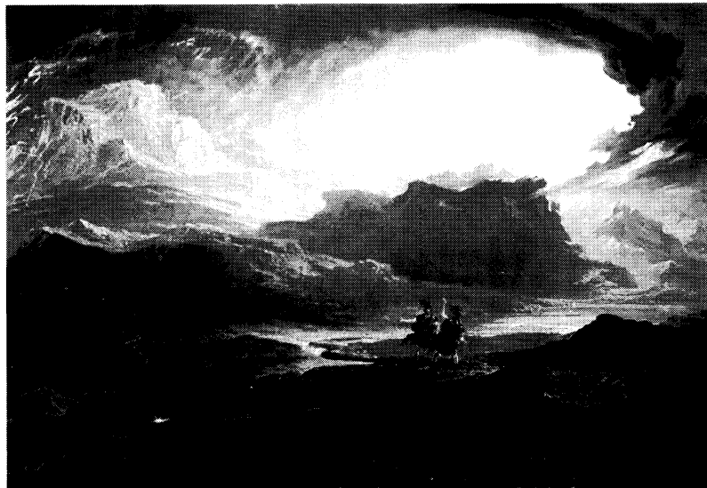
Fig. 6 John Martin, Macbeth, Banquo and the Three Witches (National Gallery of Scotland, Edinburgh)

John Martin (1789–1854) was perhaps the most important of the later painters of the Sublime in the Romantic tradition. His scenes of great catastrophes and apocalyptic events such as the Fall of Babylon and the End of the World, as in Great Day of His Wrath (1852), are now becoming better known after an oblivion of more than a century. His Macbeth, Banquo and the Three Witches (1820), now in the National Gallery of Scotland, is a small version of a very large picture, now lost. It is in the same tradition of paintings by him showing diminutive human beings lost in vast, tormented landscapes of which the best known is Sadak in Search of the Waters of Oblivion (c. 1812), now in the Southampton City Art Gallery. In the Macbeth picture (see Fig. 6), a tiny Thane of Glamis and Banquo, wearing anachronistic Highland garb, stand in a huge, barren, mountainous landscape wreathed in swirling clouds, resembling a science-fiction idea of the planet Mercury, while the three witches can be indis-