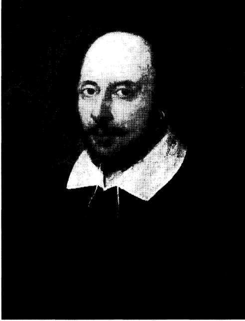
Fig. 1 The 'Chandos' Portrait (National Portrait Gallery)

this is altogether a more romantic, almost gypsy-style, Shakespeare. The general outline, bone structure and expression do not, however, contradict the features of the Droeshout engraving; it is true that the engraving gives Shakespeare a rather more bulbous forehead, but this could simply be due to lack of skill on the part of the engraver. Moreover, the Chandos portrait shows very clearly the slight deformity of the left eyelid already mentioned above in connection with Droeshout. There seems little doubt that the portrait as it now stands has been consider-