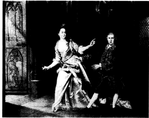
Fig. 4 Zoffany, David Garrick as Macbeth and Hannah Pritchard as Lady Macbeth (Garrick Club, London)

Another useful guide to the stage practices of the early Garrick era is a painting by Johann Zoffany (1733–1810). Zoffany, whose real name was Johannes Zauffaly, came to England from Germany and spent most of his life painting for English patrons, including the Royal Family. He is a lively and appealing artist, with a keen sense of the taste of society; his conversation pieces and family groups reflect the eighteenth century "quality" as they wished to see themselves. He saw that Garrick, although