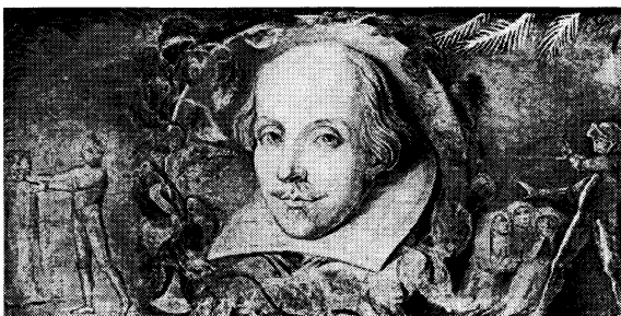
Fig. 3 William Blake, Imaginary Portrait of Shakespeare (Manchester City Galleries)

A final comment on the Droeshout version is furnished by William Blake’s Imaginary Portrait of Shakespeare (see Fig. 3), done in 1800–3 in tempera over ink on canvas as part of a series of pictures of famous writers by various artists to be hung in the library of his patron, William Hayley. It is now in the Manchester City Art Gallery. It is clearly a very close copy indeed of Droeshout, but the bust is gently wreathed in convolvulus and has the